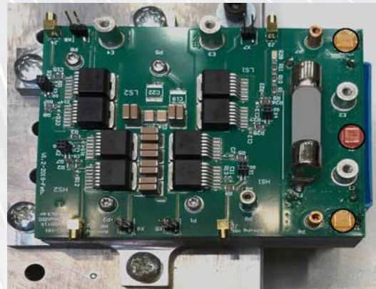
Modular Silicon Carbide (SiC)-H-bridge phase drive inverter

In cooperation with the company VINCORION JENOPTIK Advanced Systems GmbH the Professorship of Power Electronics developed a modular drive concept as part of a three-year third-party funded research project. In this concept, the Power Electronics was directly integrated into the machine and each of the more than ten machine phases was operated with its own converter. This approach and the use of new wide